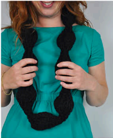
Clockwise from left: Winsome and Saucy necklace knits; Hello Dodo print; AT Open House opens its doors; and Delicious Industries notebooks.